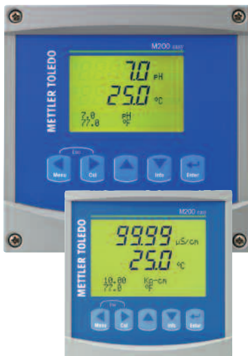
M200 easy 1/4 DIN

When expectations for a field device go beyond just good measurement, the M200 easy is convincing with its exceptional user-friendliness. It accepts all digital easySense sensors without the need for calibration or configuration. For commissioning, a user-friendly "Quick Setup" routine will guide you through the first settings.